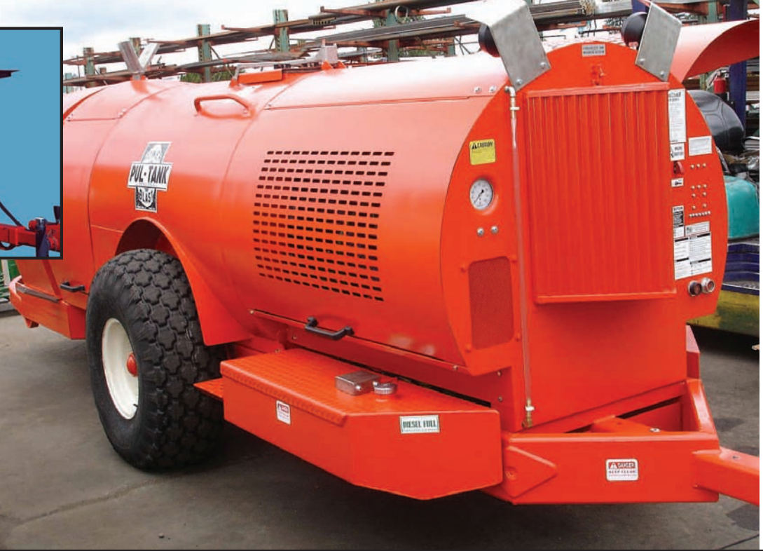
500 or 600 gallon tank with standard frame

At right, 400 gallon tank with narrow frame and 38" fan/housing.