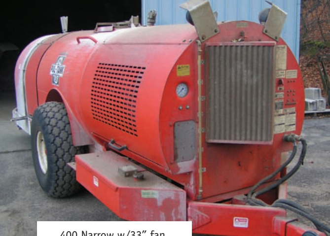
400 Narrow w/33" fan

50 gallon fuel capacity 500 & 600G units -40 gallon fuel capacity 400G Narrow